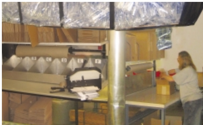
Custom overhead delivery system